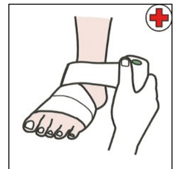
EN MI PIE